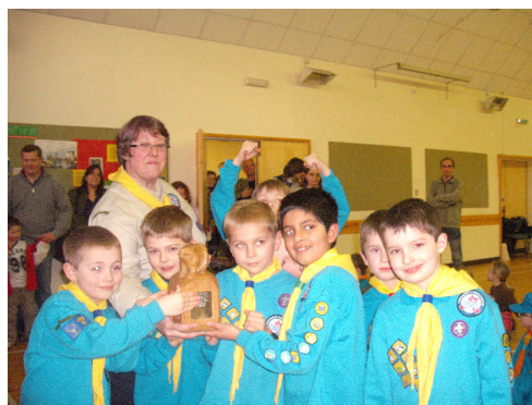
The winners with their trophy

A huge thank you to all the Leaders that helped.